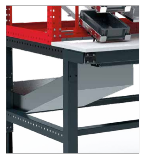
Empty container returns

The empty container return chute mounted under the table means the worker can effortlessly deposit the empty container without wasting time. The empty containers can then be retrieved from the rear by the logistics.