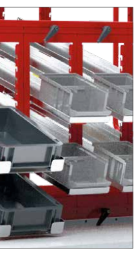
Height, depth and angle positioning

The modular system design allows the MULTIFLOW material supply system to be custom configured. Depending on the size of the small load/grab containers, the various frames can be custom-adjusted with the aid of the tool-